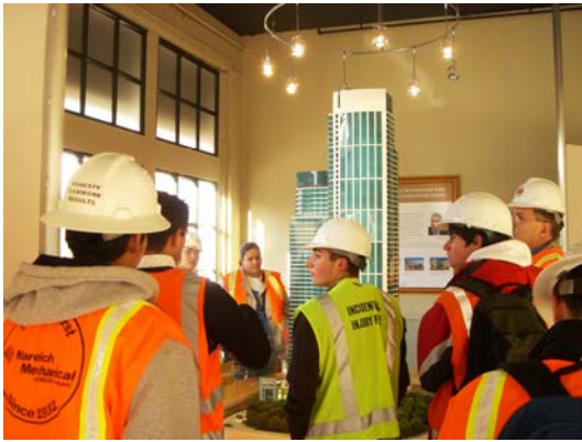
San Francisco Team tours Rincon Tower.