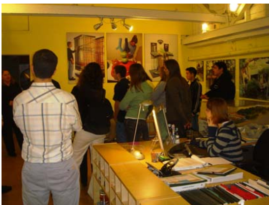
Tour of Gemmiti Model Arts in SF.