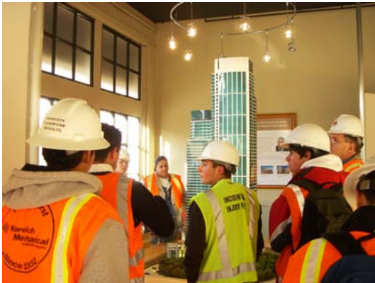
San Francisco Team tours Rincon Tower.